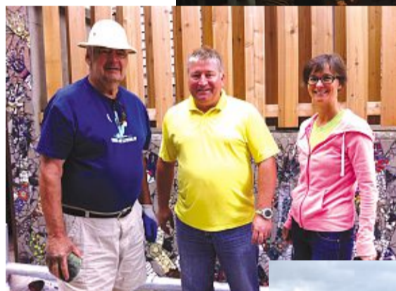
House of Friendship's aWESOME Wall connects the community! Thank you to all of the volunteers and collaborators who put their hands to work this year to beautify a space and demonstrate what can happen when neighbours work together - you're aWESOME!