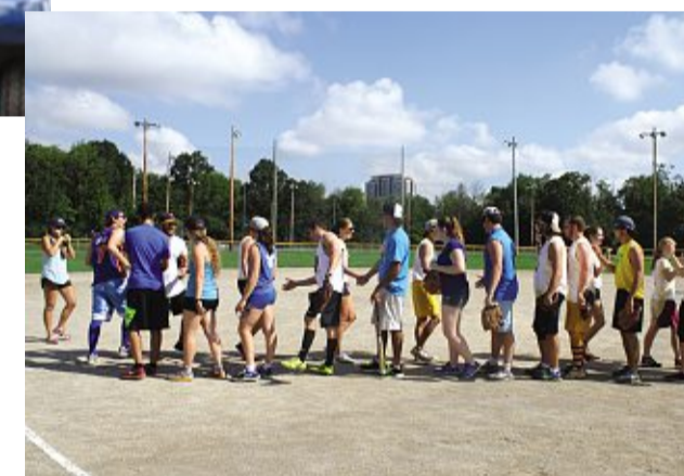
This past weekend was the annual Wilfrid Laurier University Shinerama Softball Tournament and Silent Auction. All of the Orientation Week volunteers and Laurier students participated in a friendly softball tournament and silent auction to raise money for Cystic Fibrosis research!