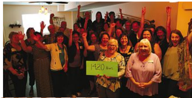
Over the past year, the volunteers at the Waterloo Region Suicide Prevention have donated 1,420 hours! This summer, our volunteers have helped organize the annual Daniel Tudisco Memorial Golf Tournament, distributed our resources to the community, facilitated a bereavement peer support group, and much more. They are currently planning Suicide Prevention Day for September 10. We love our volunteers!