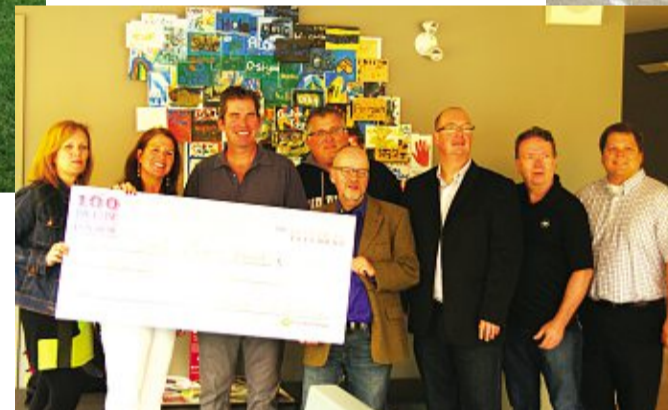
This year's Chill Bar & Grill Charity Golf Tournament was August 11 at Grey Slo Golf Club. The tournament is an annual event that has raised more than $110,000 for Grand River Regional Cancer Centre and the Children's Wish Foundation. The Grand River Hospital Foundation thanks Chill Bar & Grill for continuing to support patient care in the community.