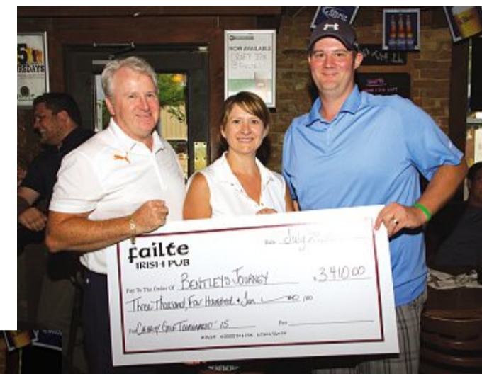
Failte Irish Pub in Uptown Waterloo held their 18th annual golf tournament to benefit KidsAbility on July 29. $10,000 was raised for KidsAbility and an additional $3,500 was donated to Bentleys Journey to Walk. Over the past 11 years, Failte's contributions to children's charities now surpass $12,000!