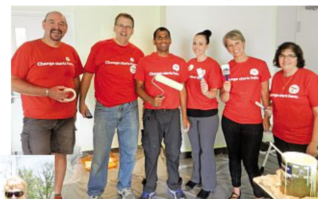
Volunteers from Rockwell Automation get busy painting the Cambridge Self Help Food Bank during United Way's Day of Caring.