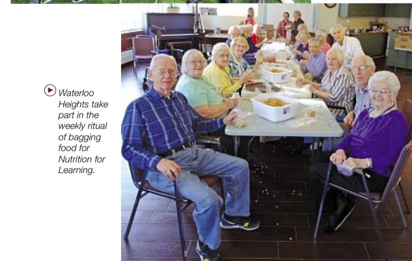
Waterloo Heights take part in the weekly ritual of bagging food for Nutrition for Learning.