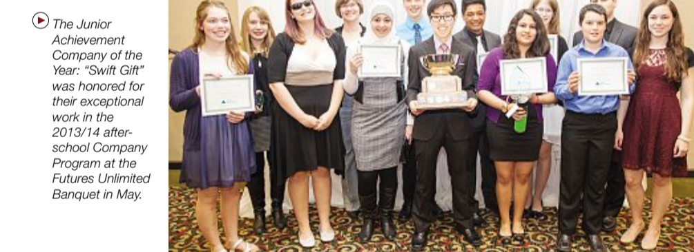
The Junior Achievement Company of the Year, "Swift Gift" was honored for their exceptional work in the 2013/14 after-school Company Program at the Futures Unlimited Banquet in May.