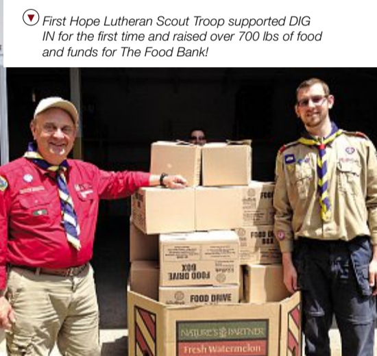
First Hope Lutheran Scout Troop supported DIG IN for the first time and raised over 700 lbs of food and funds for The Food Bank!