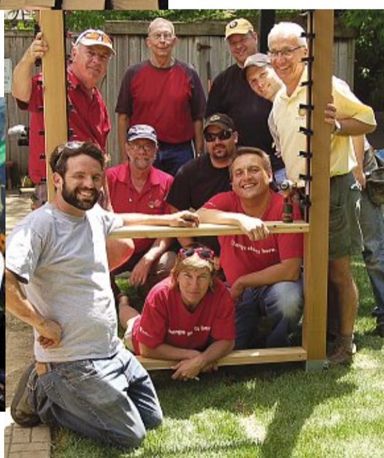
Day of Caring is about making a difference in our community with more than just dollars. It is about turning caring into action through volunteerism.