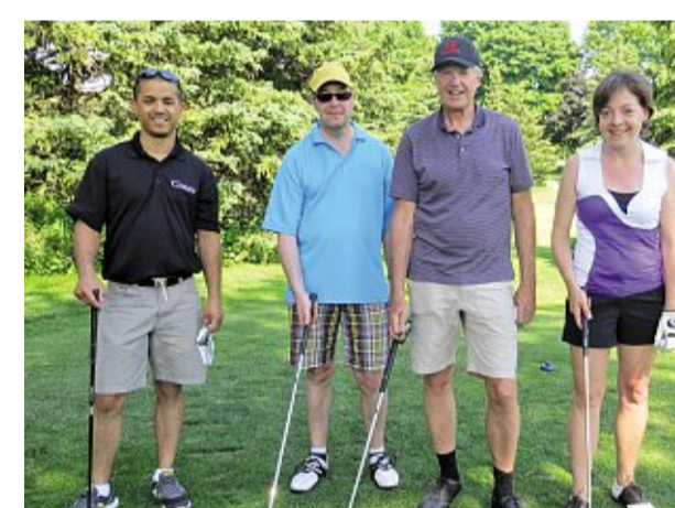
These Junior Achievement volunteers were invited to the 23rd annual JA Golf Tournament as a show of appreciation for their combined 300+ hours of volunteerism.