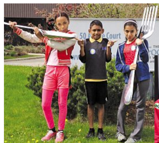
Country Hills Public School raised over 400 lbs of food for DIG IN by challenging their teachers to a track + field meet. Way to go Cardinals!