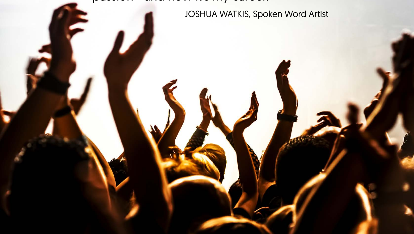
"Spoken Word" is a form of poetry that puts together writing and performance. It brings a poem to life for the audience, and lets the author of the poem read and perform it the way they want it to be experienced. Spoken Word is meant to be enjoyed and shared in communities, like your school, to share stories and perspectives.

The first time I experienced poetry in school, I wasn't quite sure what I was in for. Then, I found out that poetry was a major influence on the music I loved and the historical figures I looked up to. I became fascinated with how poems shape our thoughts and stir our emotions. Once I started writing and performing poetry myself, it became my passion—and now it's my career.