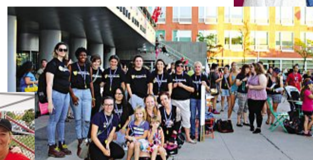
Students, faculty and staff from the University of Waterloo pose in front of Kitchener City Hall getting ready to march in the annual Take Back the Night celebration.