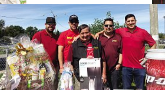
Crystal and long-time Parkinson SuperWalk volunteers at the Kitchener - Waterloo SuperWalk at Resurrection Catholic Secondary School on September 12 th .