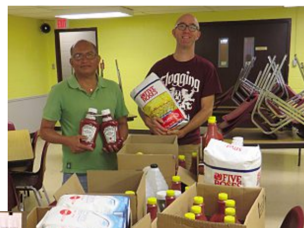
Volunteers are able to create healthy, nutritious meals at House of Friendship's Charles Street Men's Hostel thank to this generous donation of cooking staples and condiments this summer! Thanks to Cober Printing for the gift of food; helping others belong and thrive!