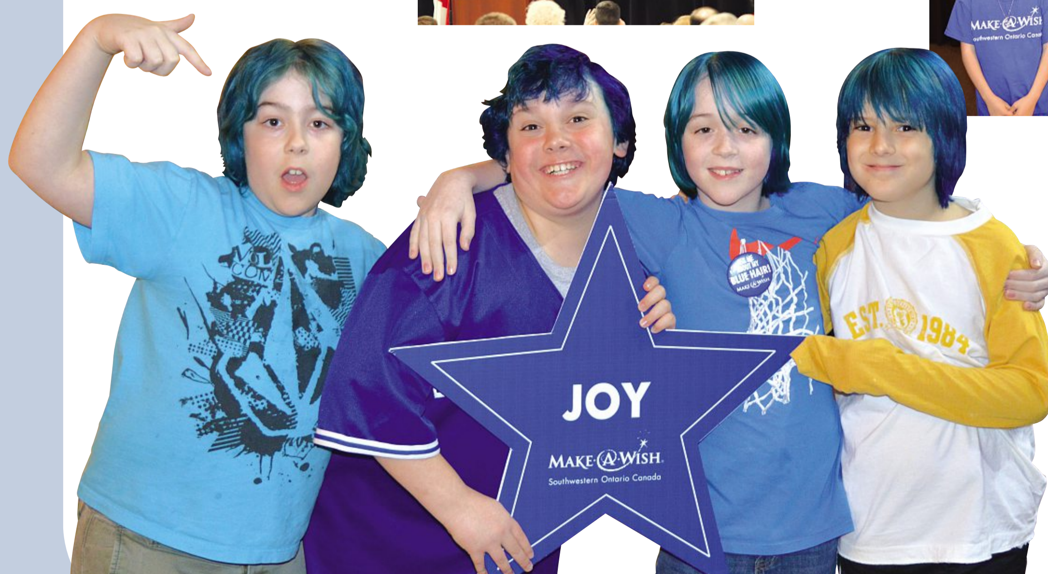
Classmates have fun going blue at Go Blue! Go Bald! in support of Make-A-Wish® Southwestern Ontario.

Look for the next Erb and Erb "Helping Hands" feature May 23rd, 2015! Deadline for photo submissions is May 20th, 2015!