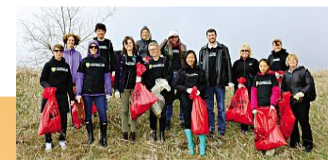
A group of students, faculty and staff from the University of Waterloo celebrate Earth Week by participating in a community clean-up.